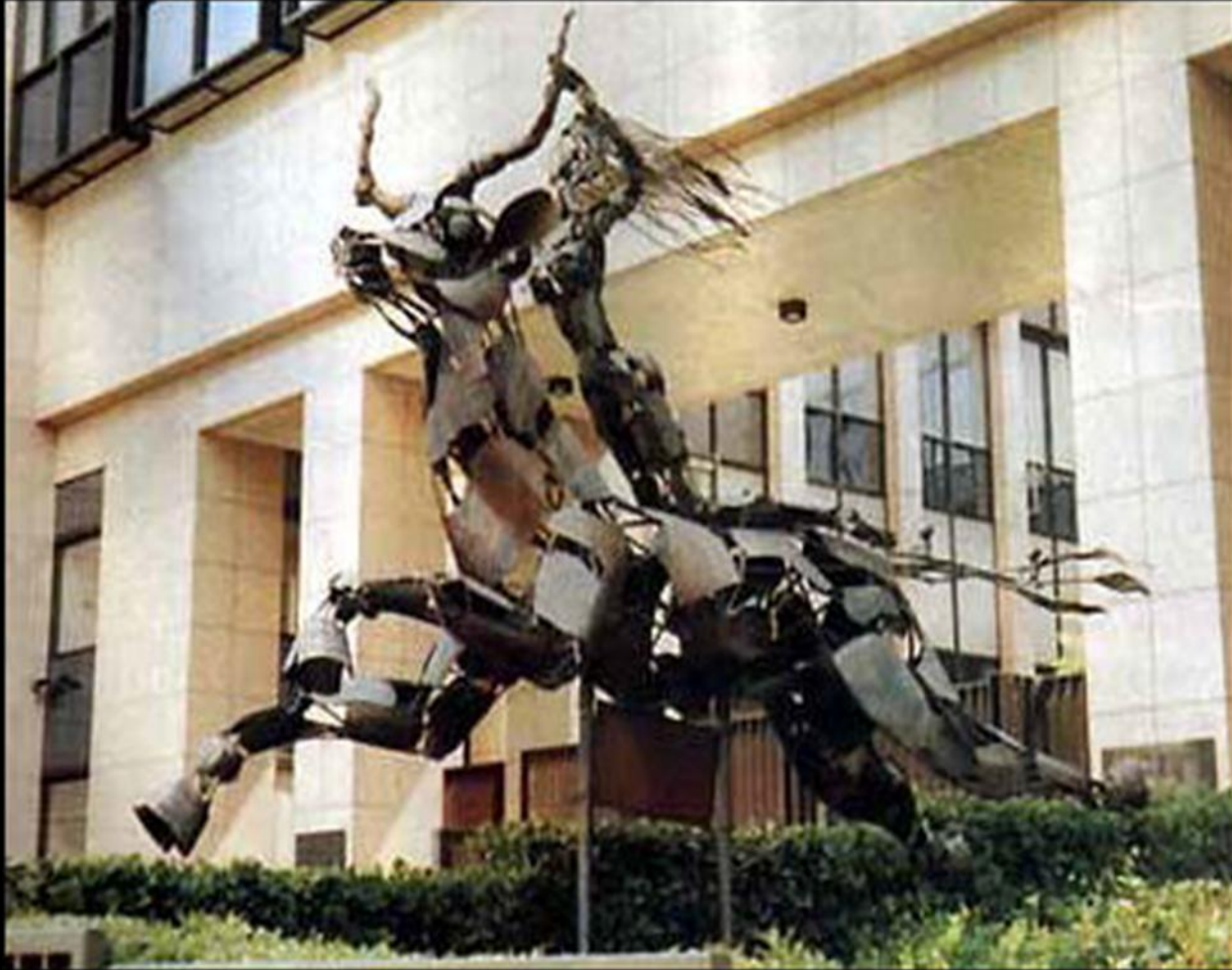
Statue in front of the EU Headquarters in Brussels, Belgium