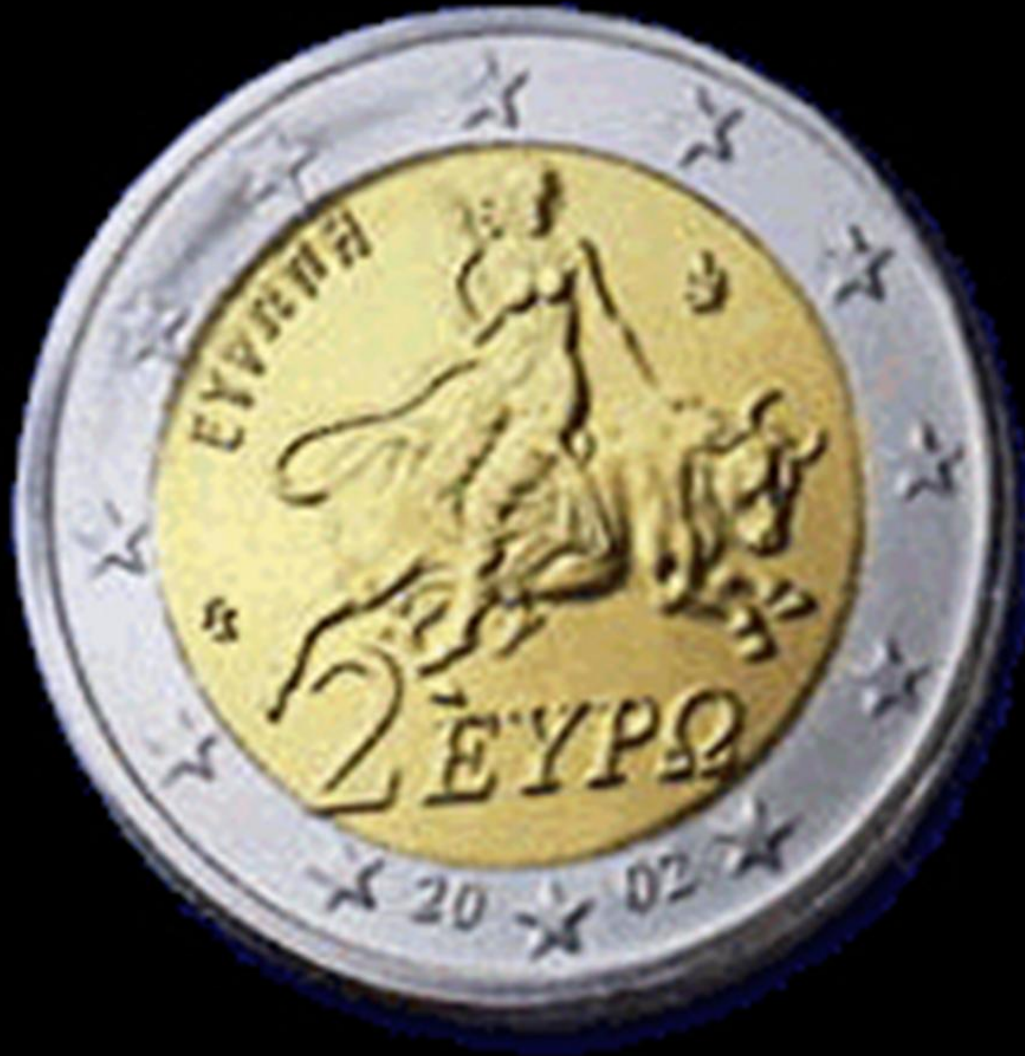
A 2 Euro coin was released in Greece that depicts a woman riding a beast