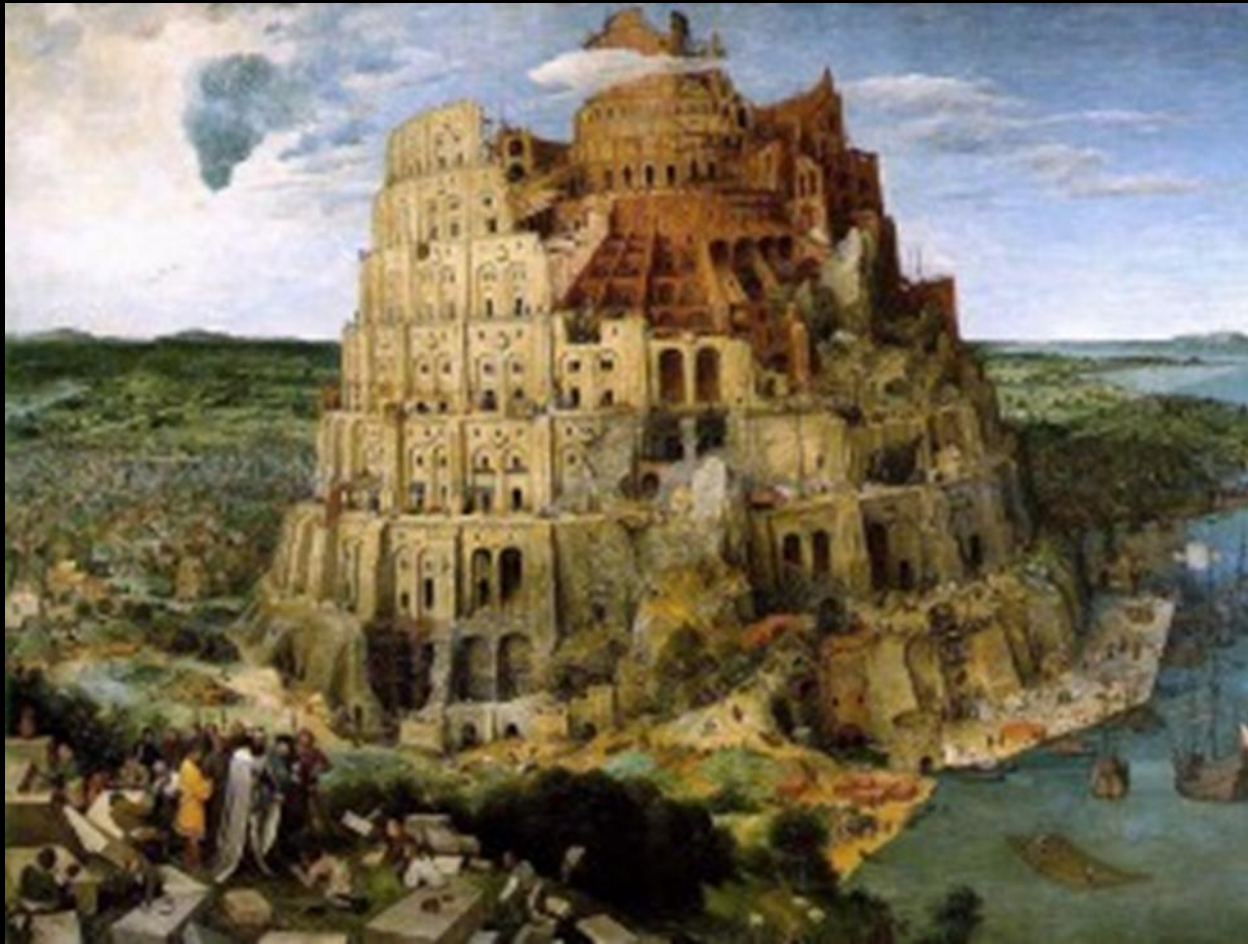
“The Tower of Babel” by Pieter Bruegel, a Flemish Renaissance painter and printmaker, 1563