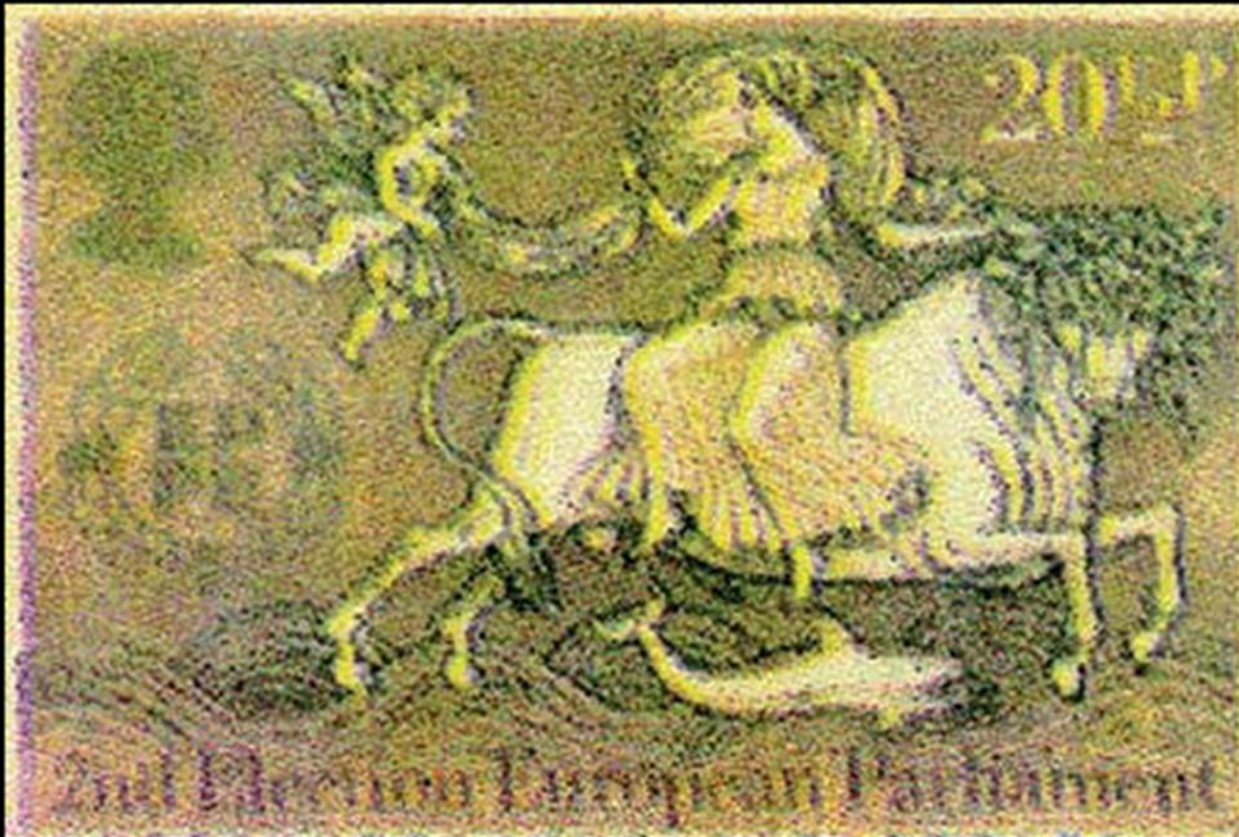
Stamp commemorating the second election of the European Parliament in 1984 – same theme -- a woman riding a beast