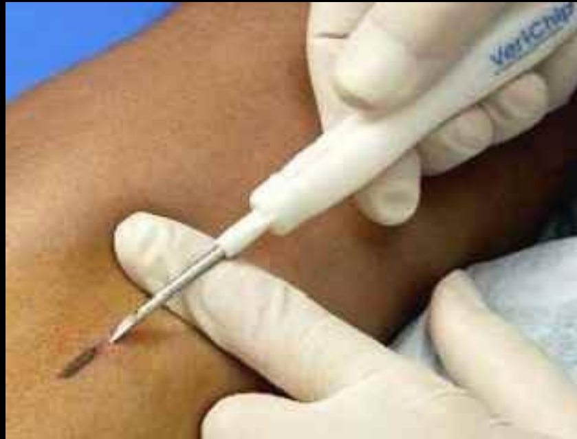
Inserting the chip